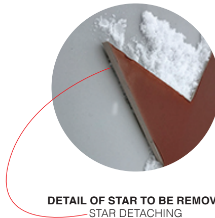
DETAIL OF STAR TO BE REMOVE STAR DETACHING