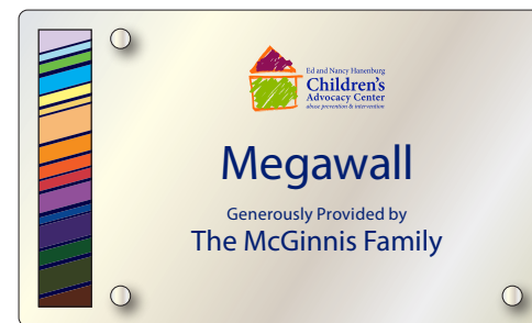
SIGN 8 ONE (1) REQUIRED