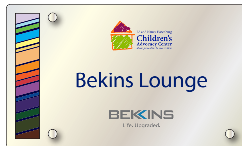
SIGN 6 ONE (1) REQUIRED