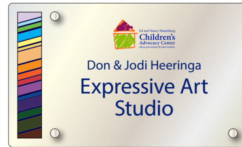
SIGN 4 ONE (1) REQUIRED