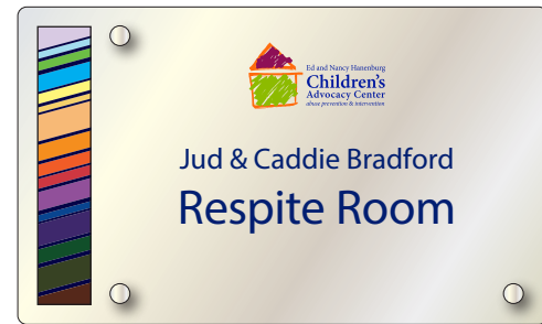
SIGN 3 ONE (1) REQUIRED