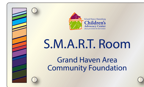
SIGN 9 ONE (1) REQUIRED