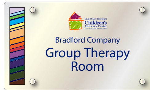
SIGN 2 ONE (1) REQUIRED