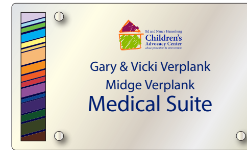
SIGN 5 ONE (1) REQUIRED