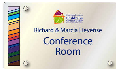
SIGN 7 ONE (1) REQUIRED