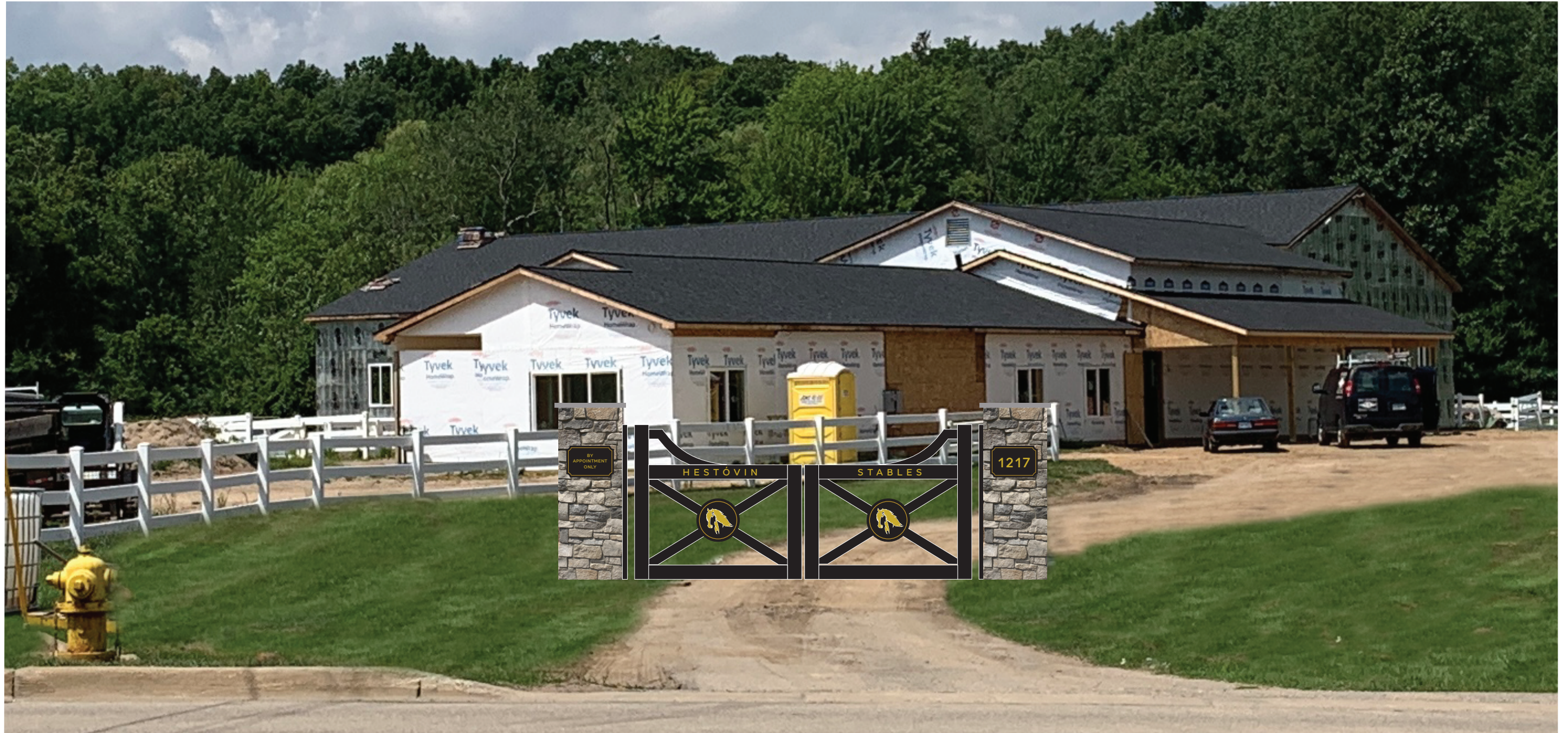
ENTRY TREATMENT VISUAL PLACEMENT - GATE & PILLAR TREATMENT